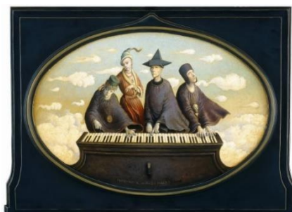
Morceau a quatres mains