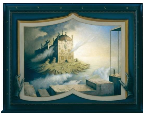
Les deux Mondes