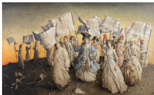
La R volution Francaise