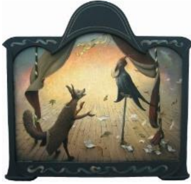
Le Corbeau et Renard