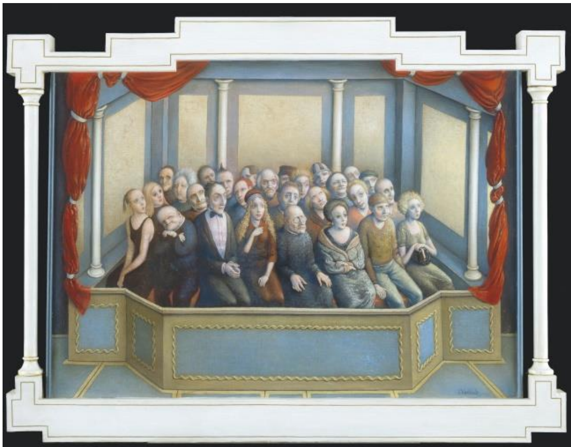
Mise en Scene