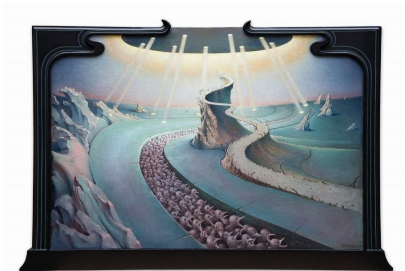
Le 2 Routes